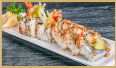
Shrimp Tempura Maki