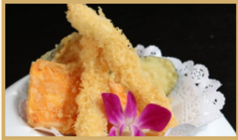
Shrimp and Vegetable Tempura

Lightly battered and deep-fried. Served with Miso Soup, Salad, and White Rice (Substitute to fried rice for $2.50 extra)